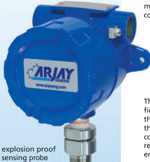
explosion proof sensing probe

Product dielectric changes in your application may not be strictly linear. Arjay has designed a 5-point calibration into the controller to enhance accuracy over an extended measurement range. This instrument is ideal for general monitoring and trending of process conditions.