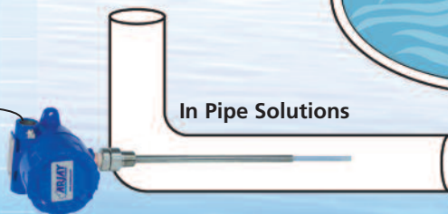
In Pipe Solutions

Monitoring concentrations to assist in process batching, oil/water knock-out treaters, glycol in water blending, etc.