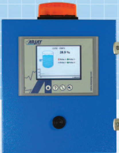
up to 1 km